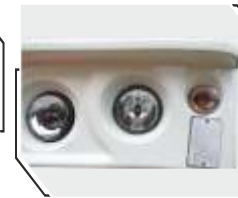
Projector type head lighting