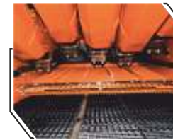
Large sieve area for optimum grain cleaning