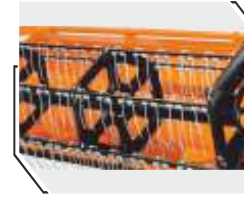
6 bar reel