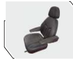
Comfortable cushioned driver seat with adjustable height