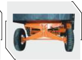
Heavy duty rear axle / offset axle