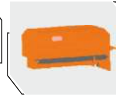
Large grain tank capacity enables long working hours with minimum interruption