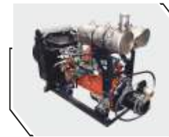
133 hp stage IV Engine