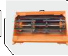
Longer feeder with 3 flats