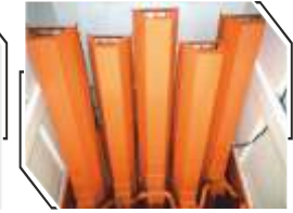
Heavy duty straw walker 1.6 mm thick