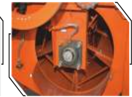
Bigger blower with flow adjustment