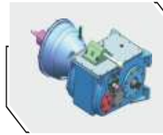
5 speed Gear box

*The product & Specifications are subject to change/discontinue without any notice on the sole discretion of manufacturer.