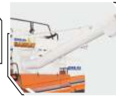
Grain unloading augur self locks