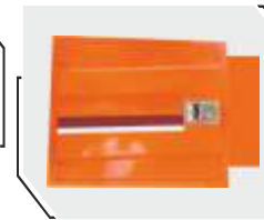
Tool kit – Safety lock