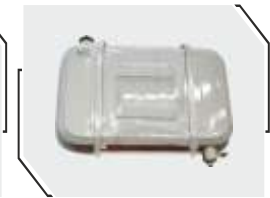
Extra capacity diesel tank