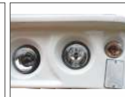
Projector type head lighting