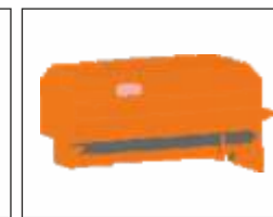
Large grain tank capacity enables long working hours with minimum interruption