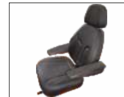
Comfortable cushioned driver seat with adjustable height