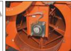
Bigger blower with flow adjustment