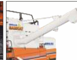
Grain unloading augur