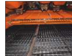
Large sieve area for optimum grain cleaning