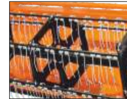
6 bat reel