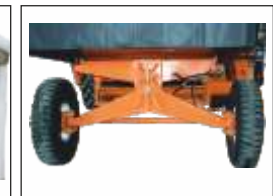
Heavy duty rear axle