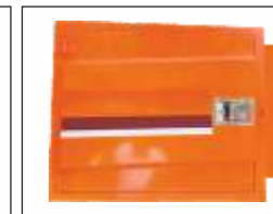
Tool kit – Safety lock