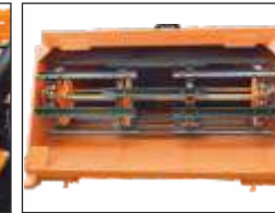
Heavy duty feeder with 4 chain & 60 feeder strips