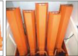
Heavy duty straw walker