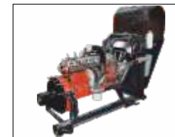
Ashok Leyland 101 HP Stage 4 Engine