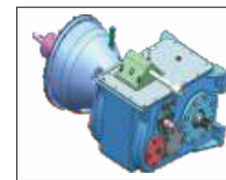
5 speed Gear box