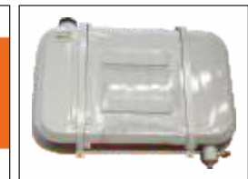
Extra capacity diesel tank