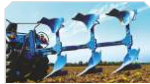
2-3 MB Plough