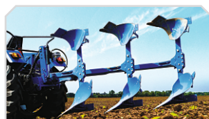
3 MB Plough