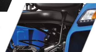
High Stance Seating 180 Degree View