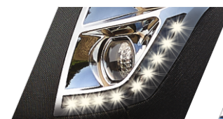
Super Luxe DRL