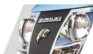
Twin Barrel Headlamps