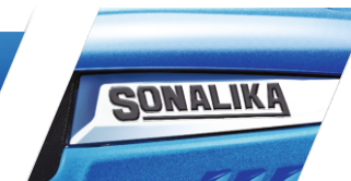
Premium Chrome Trims

Technician within 3 hours at your door step Complaint Addressal within 2 Days