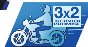
3x2 Service Promise

Technician within 3 hours at your door step Complaint Addressal within 2 Days