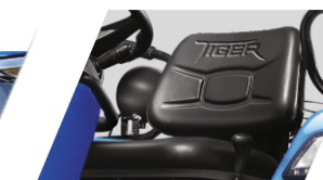
Plush Branded Seats 4-Way Adjustment