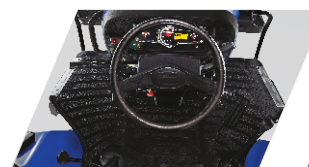
XL W-i-d-e Workspace