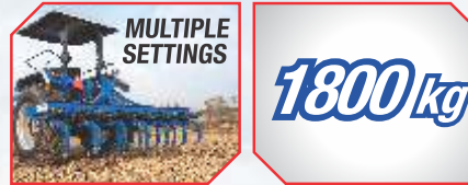
Smart sensing, high lift capacity