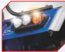
LED tail light