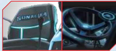
Deluxe seat & Ergo steering