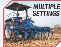
Smart sensing, high lift capacity