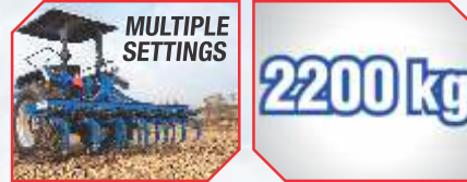
Smart sensing, high lift capacity