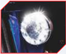
LED DRL Head light