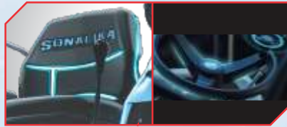
Deluxe seat & Ergo steering