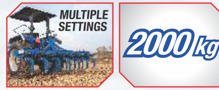
Smart sensing, high lift capacity