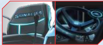
Deluxe seat & Ergo steering