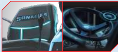
Deluxe seat & Ergo steering