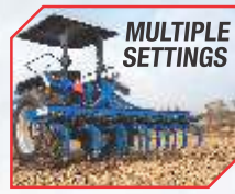
Smart sensing, high lift capacity