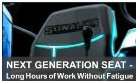
NEXT GENERATION SEAT - Long Hours of Work Without Fatigue