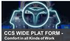
CCS WIDE PLAT FORM - Comfort in all Kinds of Work