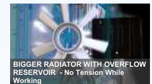
BIGGER RADIATOR WITH OVERFLOW RESERVOIR - No Tension While Working