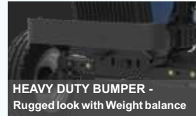
HEAVY DUTY BUMPER - Rugged look with Weight balance