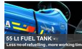
55 Lt FUEL TANK - Less no of refuelling , more working time