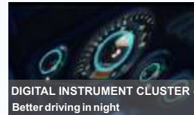
DIGITAL INSTRUMENT CLUSTER - Better driving in night