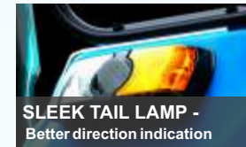
SLEEK TAIL LAMP - Better direction indication