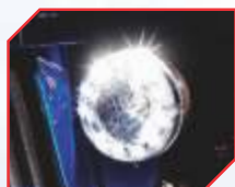
LED DRL Head light