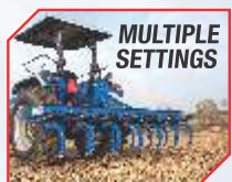
Smart sensing, high lift capacity