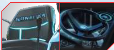
Deluxe seat & Ergo steering