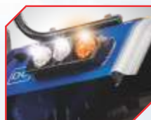
LED tail light