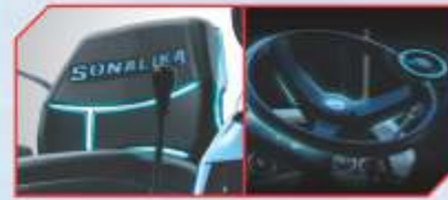
Deluxe seat & Ergo steering