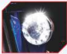
LED DRL Head light