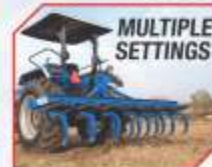
Smart sensing, high lift capacity