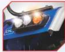
LED tail light