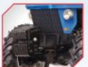
Heavy duty front axle