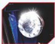
LED DRL head light