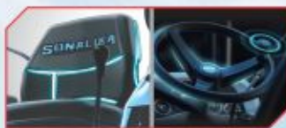
Deluxe seat & ergo steering