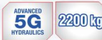
5G Hyd., high lift capacity