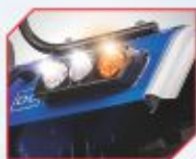
LED tail light