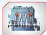
Fast pickup with 275 Nm torque