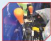
Double clutch with IPTO