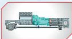
Trouble free working