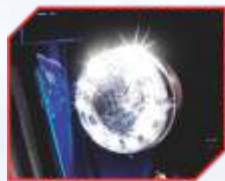
LED DRL Head light