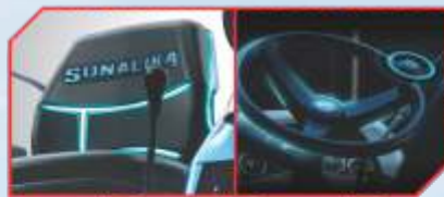
Deluxe seat & Ergo steering