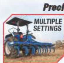
Smart sensing, high lift capacity