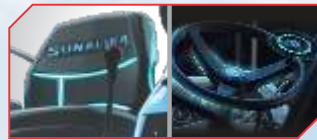
Deluxe seat & ergo steering