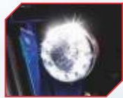
LED DRL head light