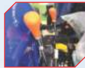
Double clutch with IPTO