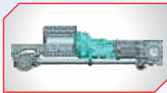
Trouble free working