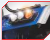
LED tail light