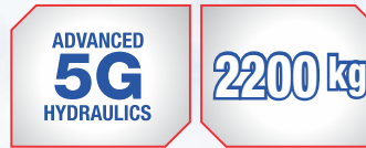
5G Hyd. with high lift capacity