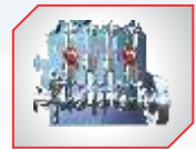
Fast pickup with 235 Nm torque