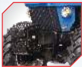
Heavy duty front axle