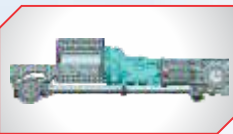
Trouble free working