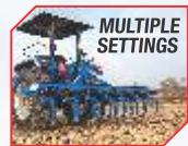
Smart sensing, high lift capacity