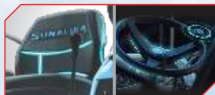
Deluxe seat & ergo steering