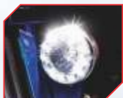
LED DRL head light