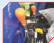
Double clutch with IPTO