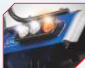
LED tail light