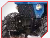
Heavy duty front axle