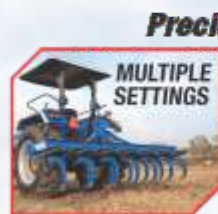
Smart sensing, high lift capacity