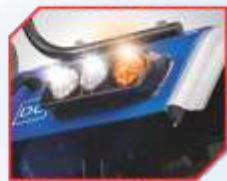
LED tail light