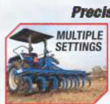
Smart sensing, high lift capacity