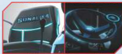
Deluxe seat & Ergo steering