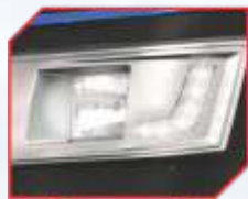
LED DRL Head light