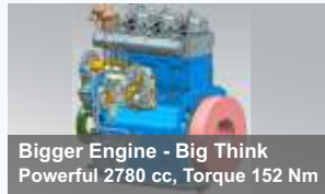
Bigger Engine - Big Think Powerful 2780 cc, Torque 152 Nm

MANUFACTURED IN THE WORLD NO.1 PLANT FEATURES