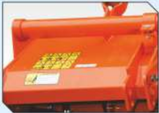
Robust structure for heavy vibration free field operation.