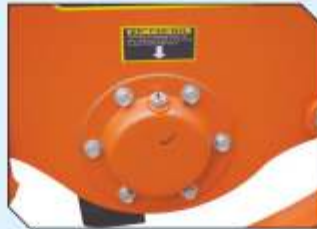
Oil immersed side bearing.