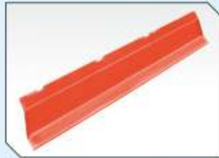
Heavy duty trailing board.