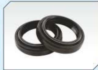
Du cone mechanical oil seals Ideal for wet land operation