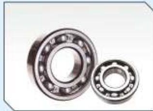
Heavy duty bearings 6311 and 6309