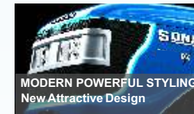
MODERN POWERFUL STYLING - New Attractive Design