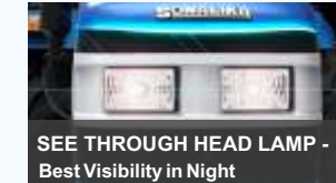
SEE THROUGH HEAD LAMP - Best Visibility in Night