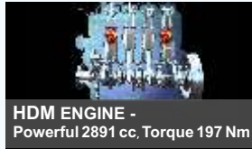
HDM ENGINE - Powerful 2891 cc, Torque 197 Nm