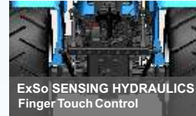
ExSo SENSING HYDRAULICS - Finger Touch Control