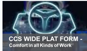
CCS WIDE PLAT FORM - Comfort in all Kinds of Work