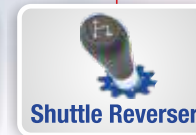
MAHA COMFORT Single Lever Forward - Reverse Puddling

Available with iPTO Rotary tools are easy to use