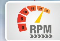
MAHA TORQUE Fastest Pick Up