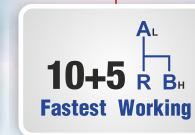
MAHA RAFTAR 15 Gears for high performance agriculture & field operations