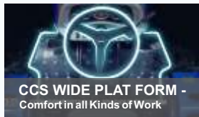
CCS WIDE PLAT FORM - Comfort in all Kinds of Work