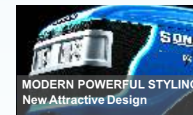
MODERN POWERFUL STYLING - New Attractive Design