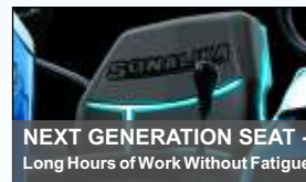
NEXT GENERATION SEAT - Long Hours of Work Without Fatigue