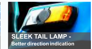
SLEEK TAIL LAMP - Better direction indication

*Since product improvement is a continuous process, specification and details provided are subject to change without prior notice. E&OE, Please correlate with latest updates, accessories shown may not be part of standard product.