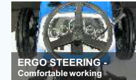
ERGO STEERING - Comfortable working