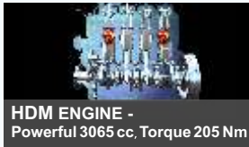
HDM ENGINE - Powerful 3065 cc, Torque 205 Nm