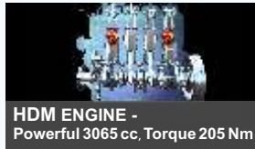
HDM ENGINE - Powerful 3065 cc, Torque 205 Nm