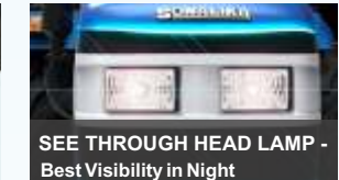
SEE THROUGH HEAD LAMP - Best Visibility in Night