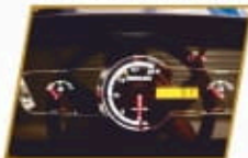
Next Gen Cluster