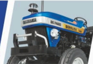
Muscular Built with Blazing Blue & Golden Badging