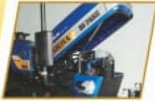
Ezz Lift Bonnet with Gas Struts