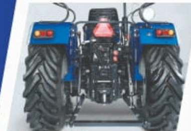
Robust Backend Rear Axle, Lower Linkages & Fenders*