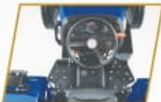
Ergo Deck Platform