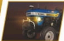
Golden Glow Headlamp