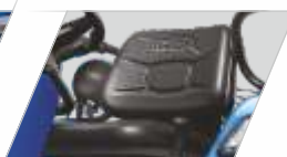
Plush Branded 2 Plane Adjustment Seats