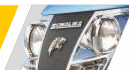
Twin Barrel Headlamps