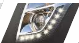
Super Luxe DRL