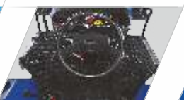
XL W-i-d-e Workspace